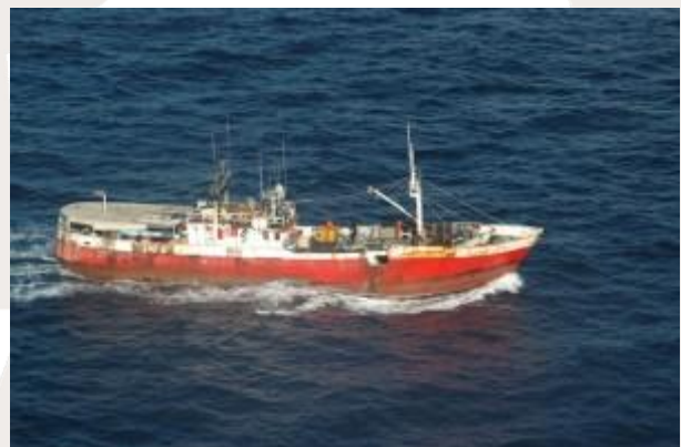
Fishing Vessel SAKOBA

The ship is believed to be Spanish owned. At the moment EU NAVFOR has no information concerning the nationality or number of the crew. The SAKOBA is heading towards Haradere and EU NAVFOR is continuing to monitor the situation.