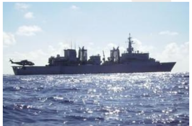
EU NAVFOR Italian warship ITS ETNA

This was the start of a weekend where the Command Ship ITS ETNA , FS NIVOSE and their helicopters and the Maritime Patrol Aircraft from Luxemburg, Spain and Sweden were involved in the disruption of 5 pirate action groups, including the destruction of