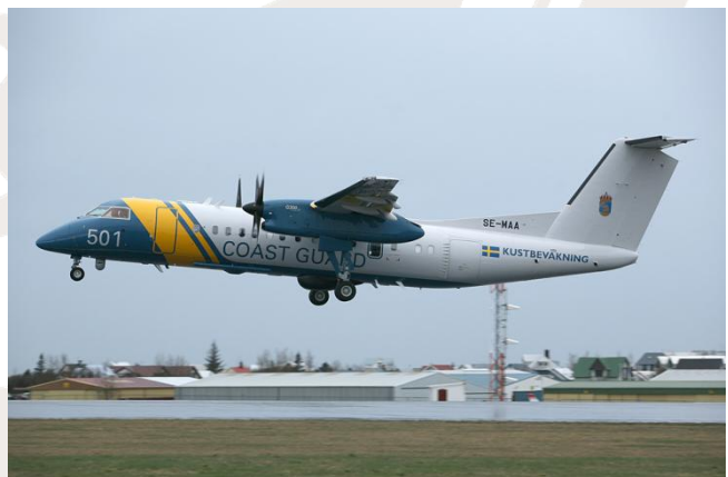
Swedish Coast guard Maritime Patrol Aircraft (MPA)

During the next four months one of the Swedish Coast Guard aircraft, a DASH 8, will monitor the waters off the coast of Somalia providing the Force Commander with essential information on the movements of ships in the area.