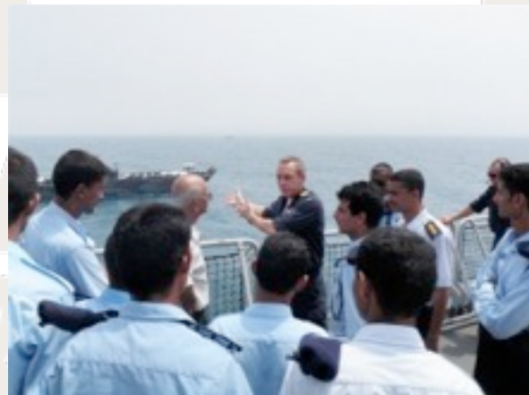
Yemeni Coast Guard being instructed in boarding and small boat operations.

EU NAVFOR ship HNLMS JOHAN DE WITT conducted a training package for 50 members of the Yemeni Coast Guard. The training programme was a combination of classroom theory and practical exercises.